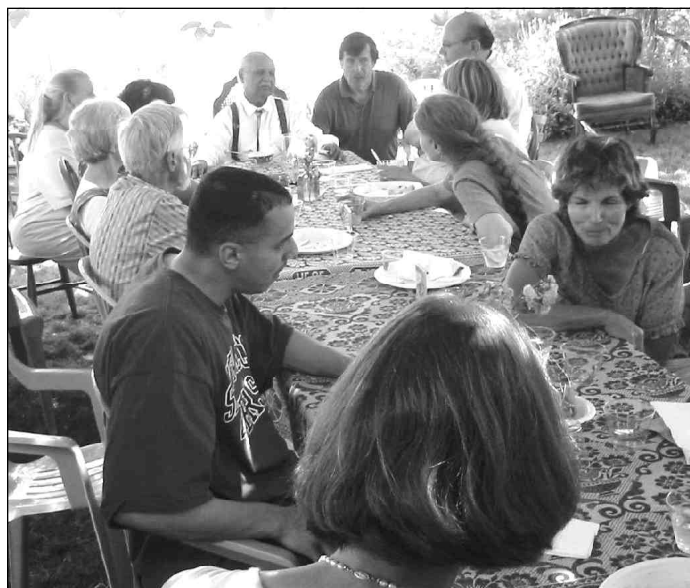
Tea in the garden.